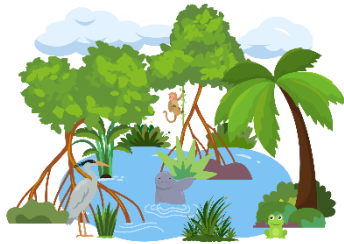
ECOSYSTEMS, FORESTS & WATER